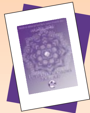
The Muslim Women's Association recently published their Future Directions 2002-2007 .

The meetings provide a platform to share knowledge and build partnerships with organisations working in the community. The Department is exploring opportunities to support the work being done and to assist