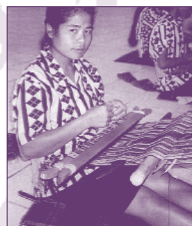
Women of East Timor weave Tais, traditional ceremonial textiles. Visit the Virtual Museum at www.etimortais.org