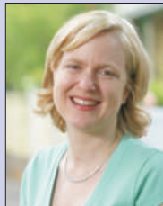
Verity Firth Minister for Women

While women continue to be under-represented in leadership and decision-making positions, programs such as 'Lucy' make an important contribution in helping to redress this imbalance.